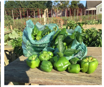
Abundance of Peppers!

Included in this newsletter are 2 postcards highlighting the worship by phone option. Please prayerfully consider who you are