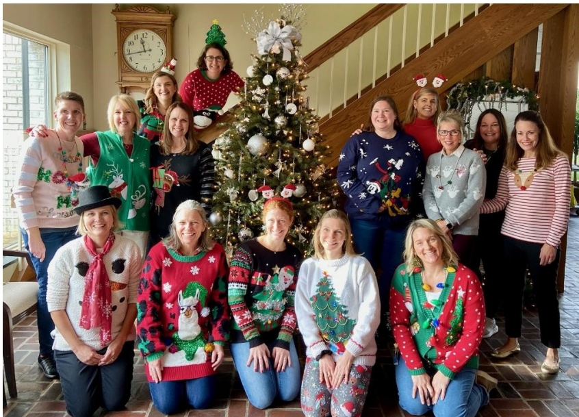
Happy Holidays from the ACP Staff

Please continue to let family, friends, and neighbors know that registration for the 2023-24 school year begins January 2nd and we will hold an Open House on January 12th from 6:30-7:30PM. Check out our website and/or Facebook page for more information.