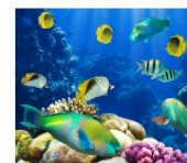
July 20 Fish