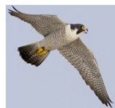
July 6 Birds