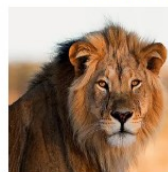
June 29 Mammals

Church of the Apostles UCC wAcky WeDnEsDaY A FREE reading program which offers a story, activity, and snack for children. God's Animal Kingdom: Fur, Feathers, Fins, and Scales Become an animal explorer as you learn about new animals each week!