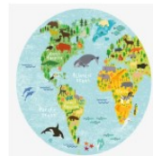
August 3 Help the Animals!

Time: 10:00 - 11:30 am Dates: June 29, July 6, 13, 20, 27 and August 3 Where: Rader Park on Church of the Apostles Campus 1850 Marietta Avenue Lancaster, Pa 17603 (Follow Apostles Way to the end behind Homestead Village)