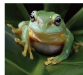
July 27 Amphibians