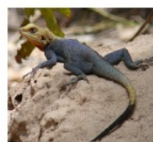
July 13 Reptiles