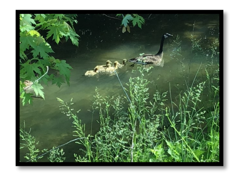
Have you met the new family in Rader Park?