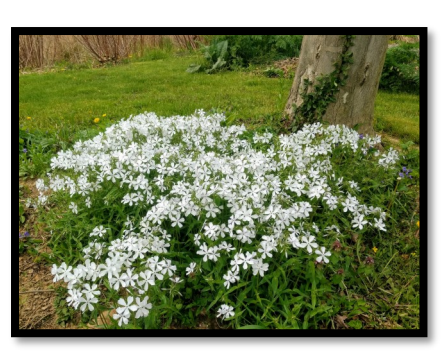
Can you find this around the church?