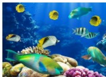
July 20 Fish