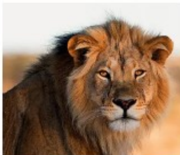
June 29 Mammals

Become an animal explorer as you learn about new animals each week!