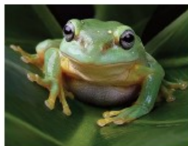
July 27 Amphibians