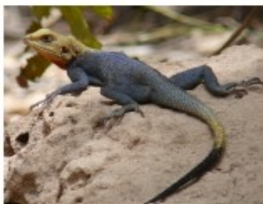
July 13 Reptiles