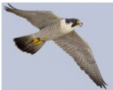
July 6 Birds