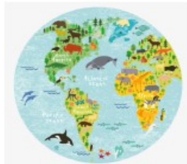
August 3 Help the Animals!