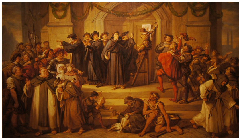
This 19th-century painting by Julius Hübner sensationalizes Luther's posting of The 95 Theses Before a crowd .