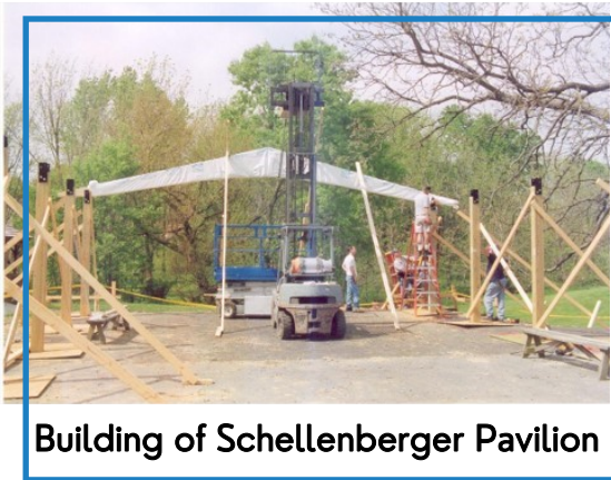
Building of Schellenberger Pavilion

As the years went on, major upgrades followed: refurbishing Fellowship Hall, replacing windows, repairing chimneys, and installing new lighting systems. In 2010, the church roof was replaced, a project embraced unanimously by the congregation.